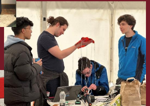
Soldering the wires and testing the software