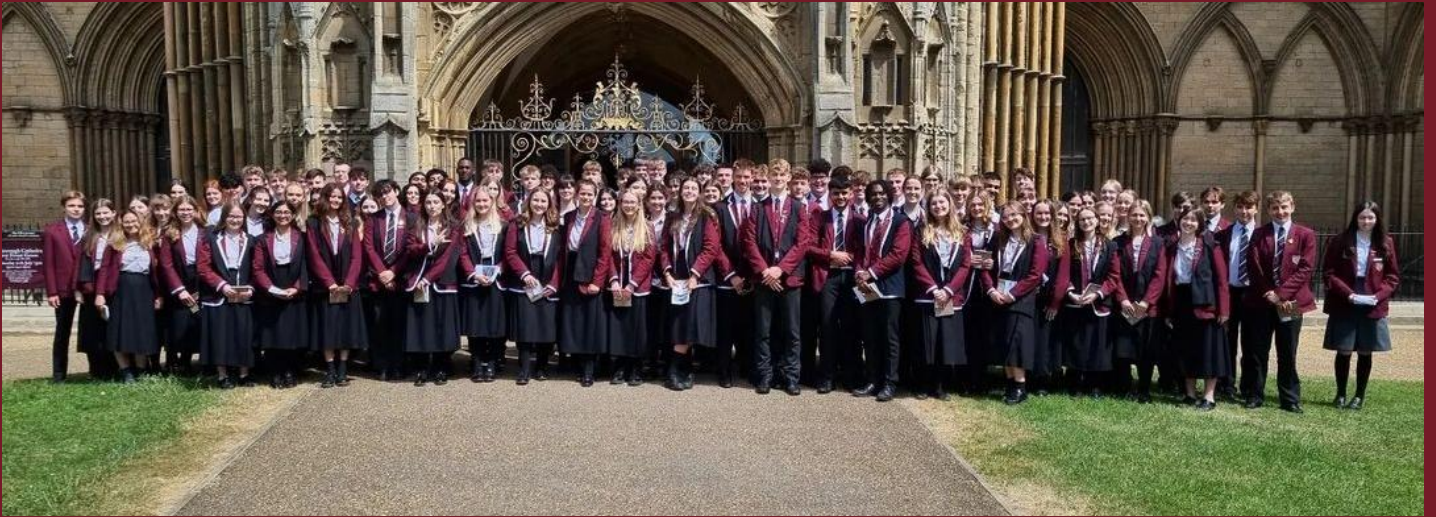
The Year 13 leavers assembled outside the Cathedral

The Leavers' Service was this term – a time to reflect on the journeys of the leaving Year 13s and Year 11s. They will all be dearly missed at the school but we hope that whatever happens next, they live life to the fullest.