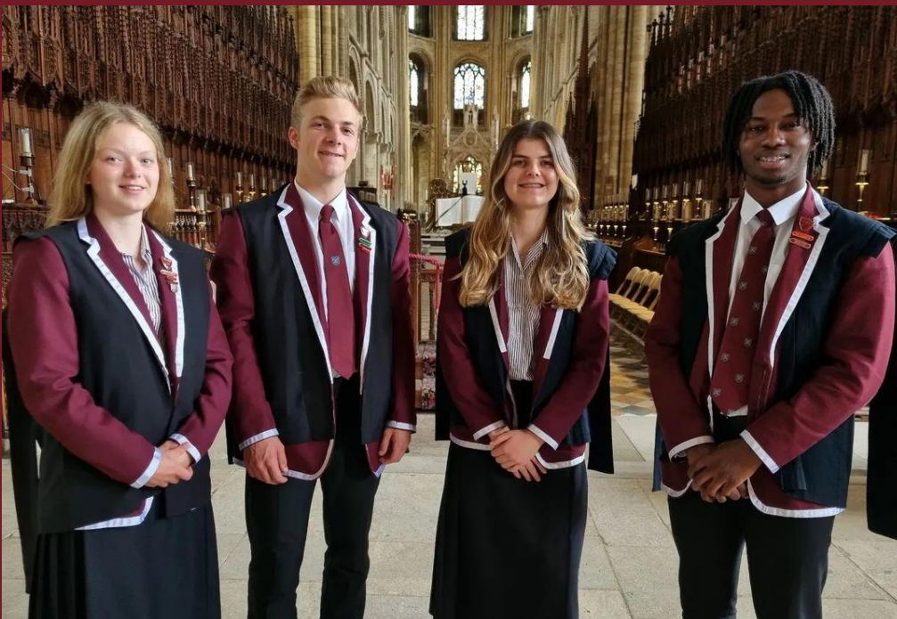
Left: The new Head Students with their Year 13 counterparts