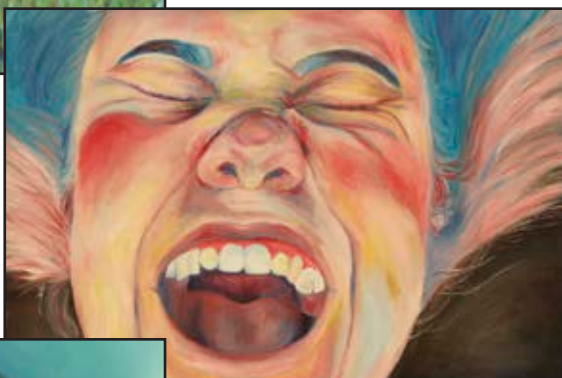
Tamara Jones, A-level Fine Art