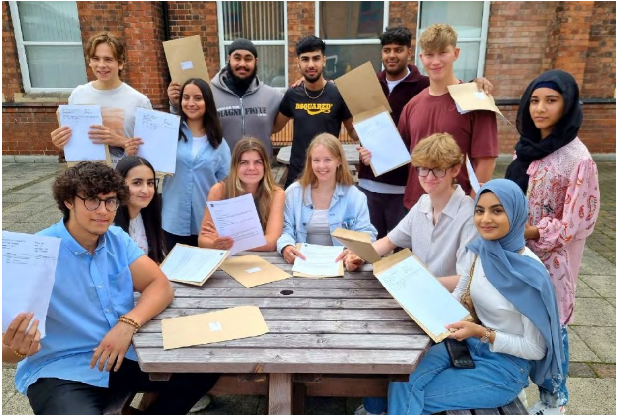
A-Level Results day

Students are fully supported throughout their Sixth Form career by their Form Tutor, the Sixth Form Team, their individual subject teachers and a dedicated Pupil Support Officer. We monitor students carefully, to identify those who are experiencing academic or pastoral difficulties. We aim to provide sensitive support for students during their Sixth Form career.