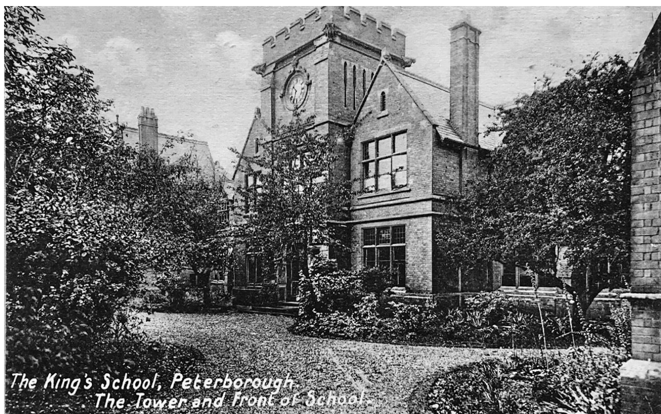
The King's School, Peterborough The Tower and Front of School

Since becoming comprehensive and co-educational in 1976, The King's School has maintained its outstanding record of success. Pupils of all abilities are encouraged to achieve their highest academic potential. Other aspects of development are not neglected: there is plenty of opportunity for participation in music, drama, outdoor activities, sport and social events, as well as a range of clubs and societies, catering for leisure pursuits. Our children are expected to develop a sense of responsibility for their conduct and behaviour, and to become aware of the needs and rights of others. The size of the School enables each pupil to find a sense of both identity and security: new pupils soon settle in and become part of our extended family. The School is very much up-to-date, and offers pupils a thorough preparation for life in the twenty-first century.